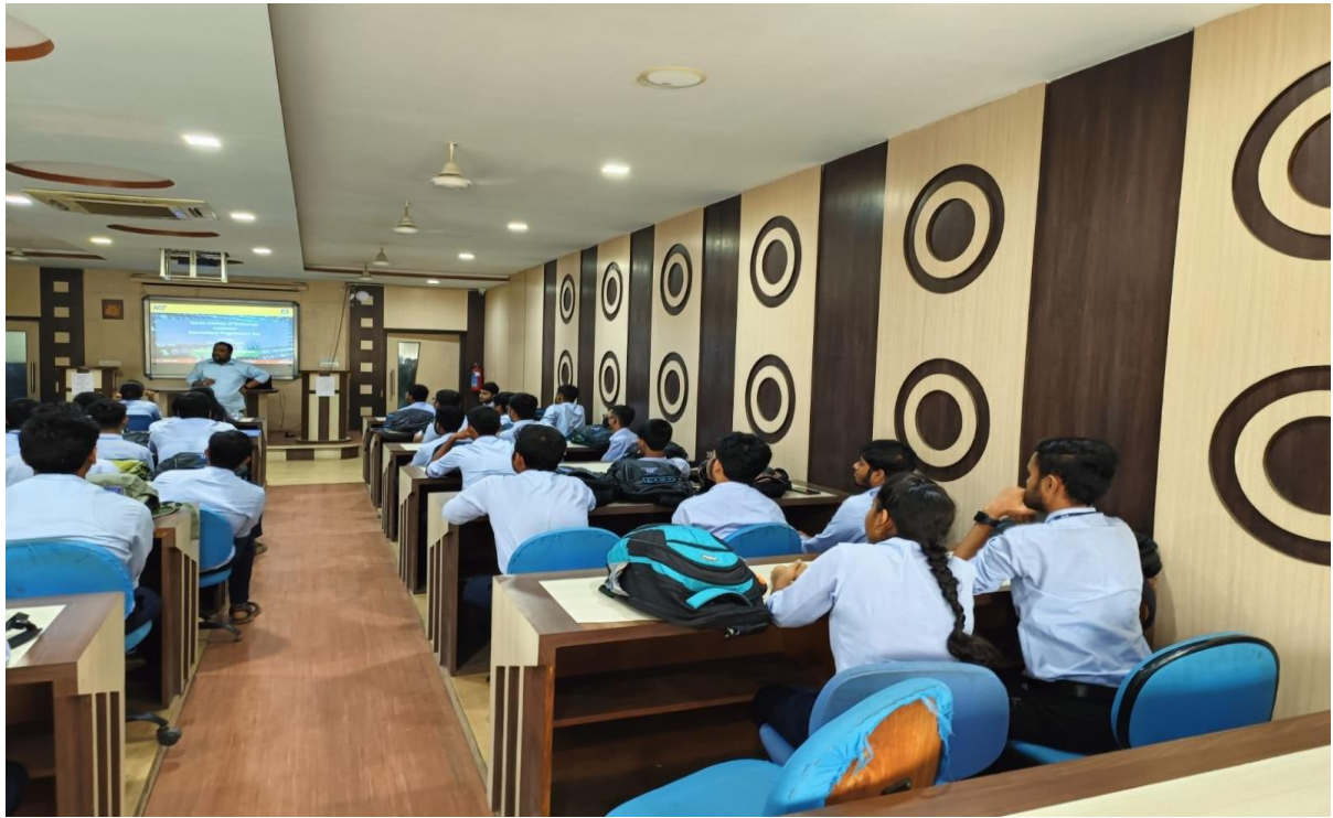
Soft Skill Training – CSE (B. TECH)